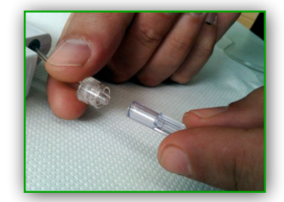
Connection "luer-lock" tube-probe

Before using the balloon probe, for the treatment of pressure biofeedback, it is essential to connect the male Luer-lock connector of the tube that comes out of the probe to the female Luer-lock connector coming from the biofeedback equipment.