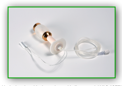
Vaginal probe with electrodes and balloon, model VAG-2STFW